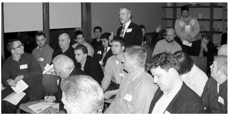
Call to Action attendees during the Q&A session.

Please submit photos from your era. Send them to the Alumni Relations office. Your efforts may help rekindle some warm memories within our Sigma Chi brotherhood!