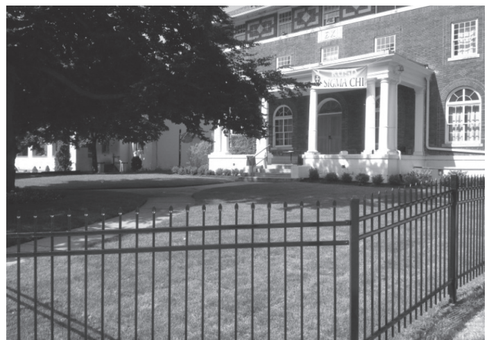
Sigma Chi is sporting some great new landscaping updates!

Feel free to contact me with any questions or suggestions and thank you again for your continued support.